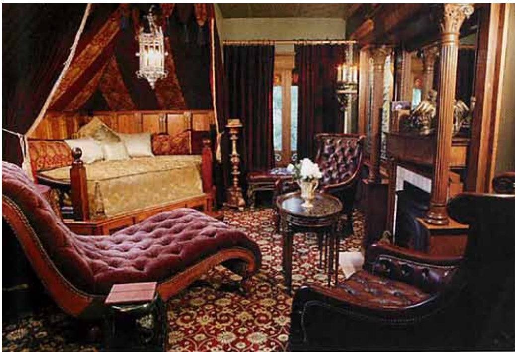
Somewhere old Queen Victoria is smiling because the Rivertown Inn has spared no expense in re-creating the lavish splendor of the Victorian Age, whether it's the furniture and rugs chosen to decorate its carriage-house suites (above), the attention to detail given to the inn's exterior and surrounding grounds (right, top) or the posh fixtures used in its themed bathrooms, such as the Oscar Wilde bathroom (right, bottom).